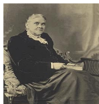
The prophets testimony

There are some today within Adventism that want to make a point of test out of nonsalvational issues. Such as the 144,000 and the nature of the Holy Spirit. All that this brings is division and sidetracks from the message that is to be given and the work that is to be done. The spirit of prophecy is clear on this point and mentions the two above subjects as nonessential to salvation. I don't expect anyone to take my word for it, lets allow the spirit of prophecy to explain itself. Here we present an example of a testimony given.