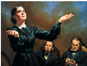
The prophets council

As long as we as a people line up behind men, to follow them and allow them to interpret the scriptures for us, we will always fall in these errors. The Holy Spirit is the interpreter of the scriptures and no matter what brother, elder, or pastor may tell you. God has not given us a message to preach that proclaims the exact time of his coming.